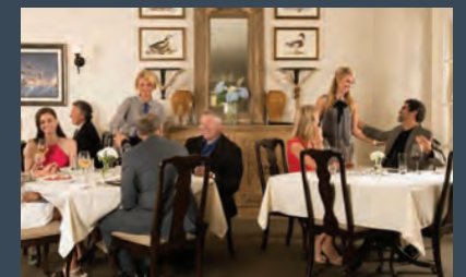
CASUAL & FINE DINING