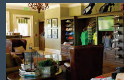
GOLF PRO SHOP