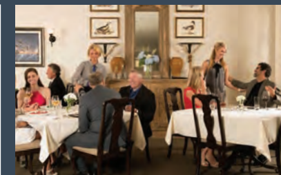
CASUAL & FINE DINING