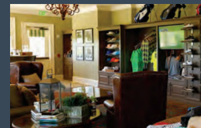
GOLF PRO SHOP