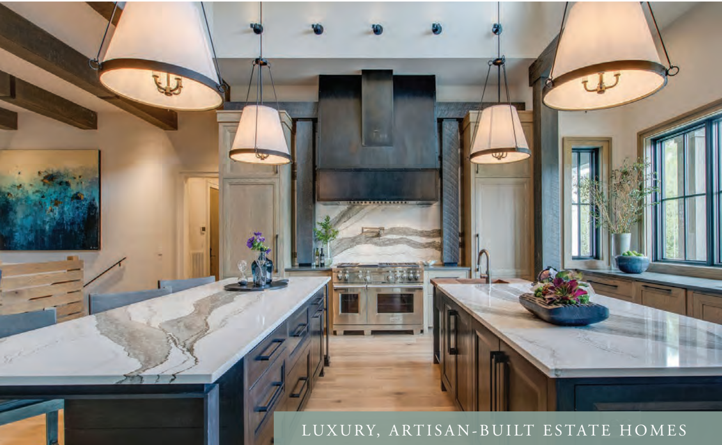
LUXURY, ARTISAN-BUILT ESTATE HOMES