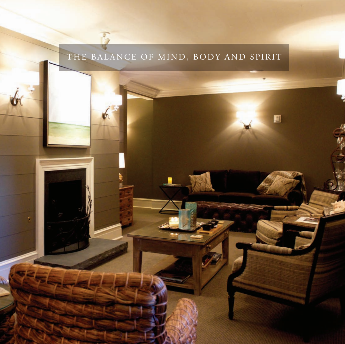
THE BALANCE OF MIND, BODY AND SPIRIT