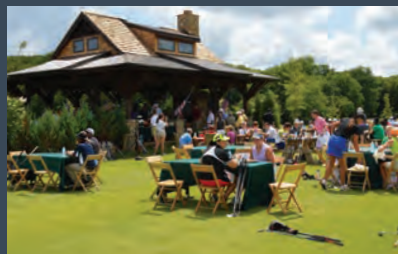
TOURNAMENTS & EVENTS