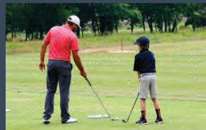
KIDS' GOLF CLINICS