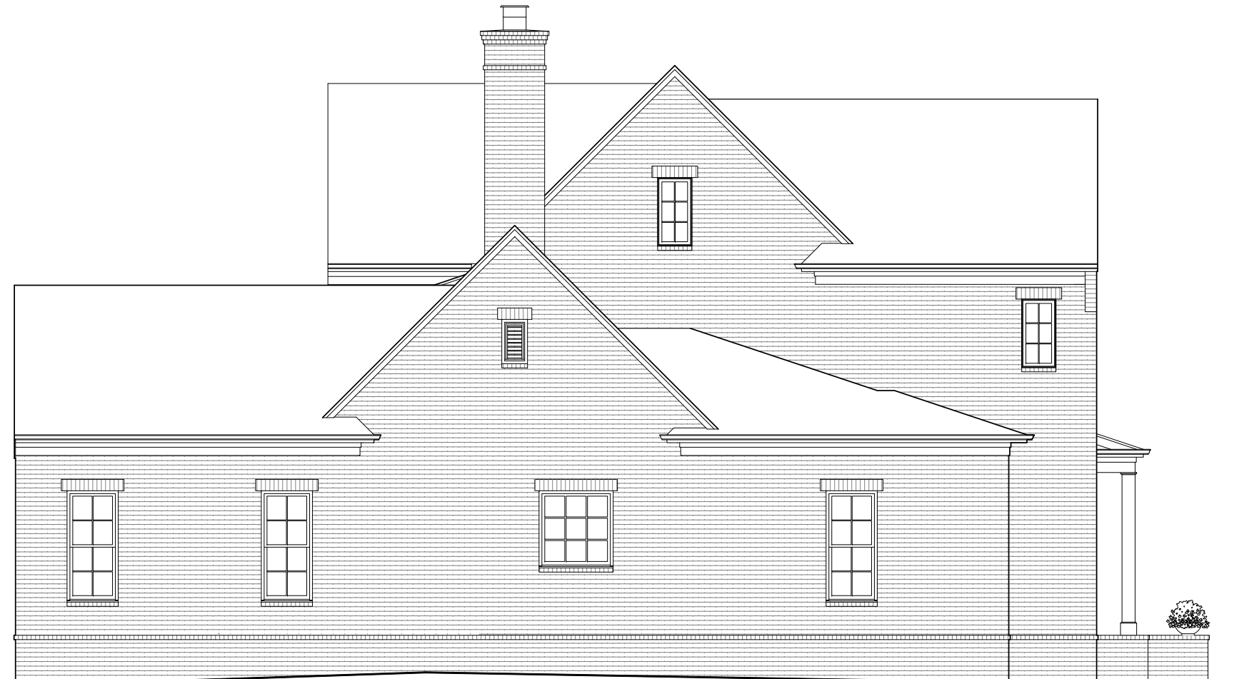
1 LEFT ELEVATION 1/8" = 1'-0"

GROVE LOT 13041 9209 JOINER CREEK ROAD PLAN NAME