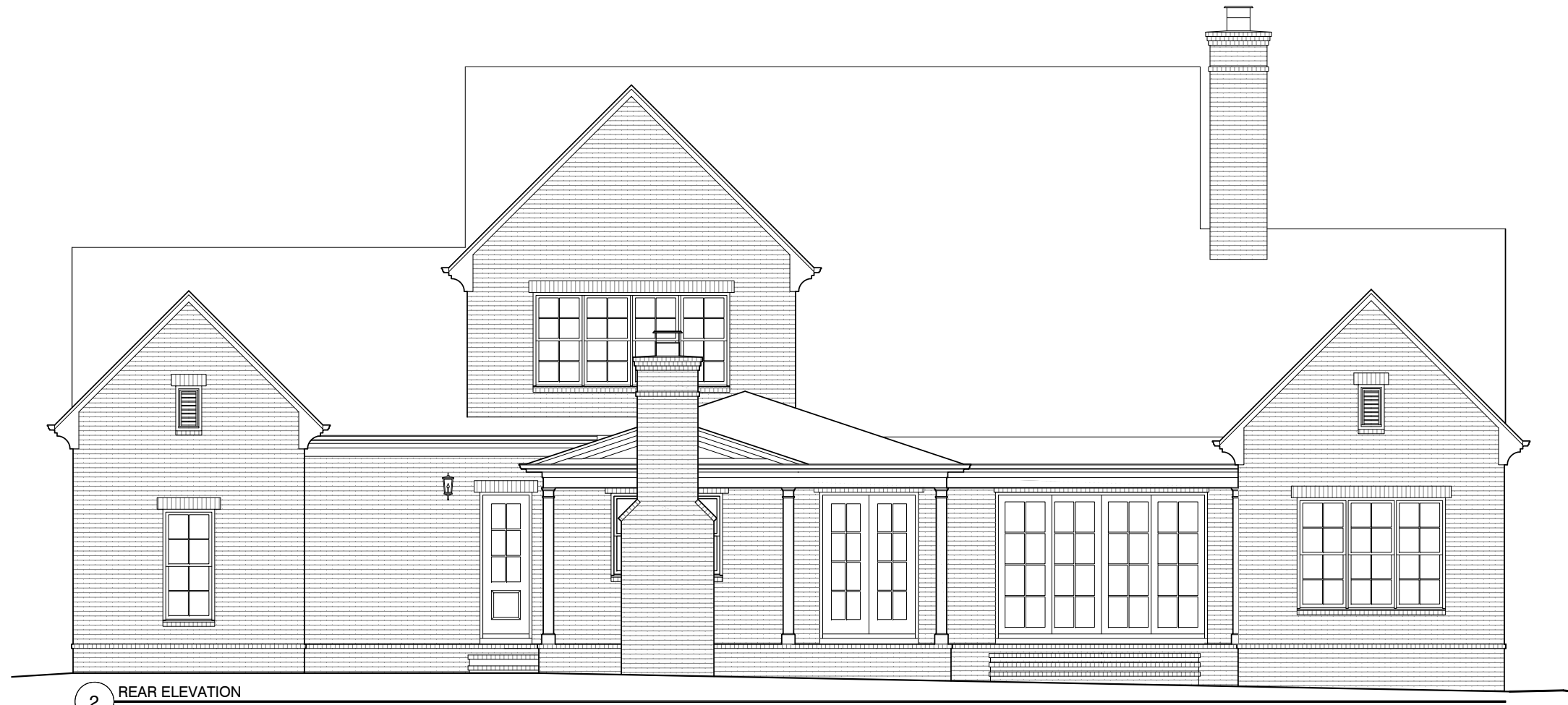
2 REAR ELEVATION 1/8" = 1'-0"