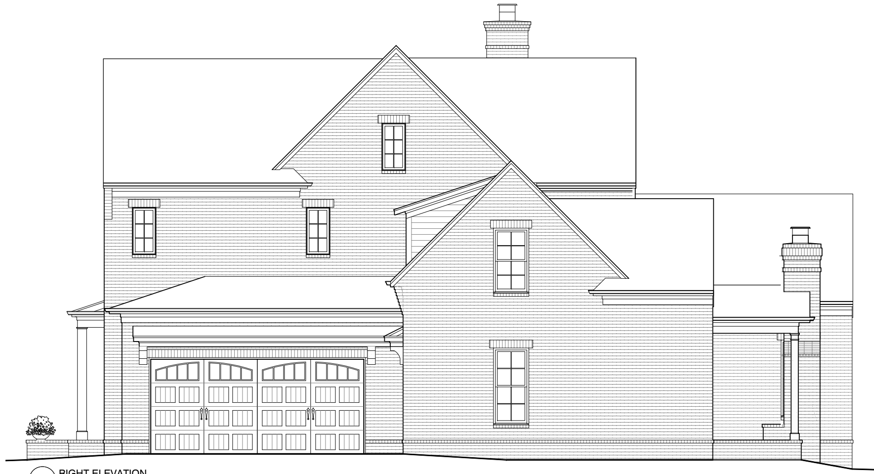
2 RIGHT ELEVATION 1/8" = 1'-0"