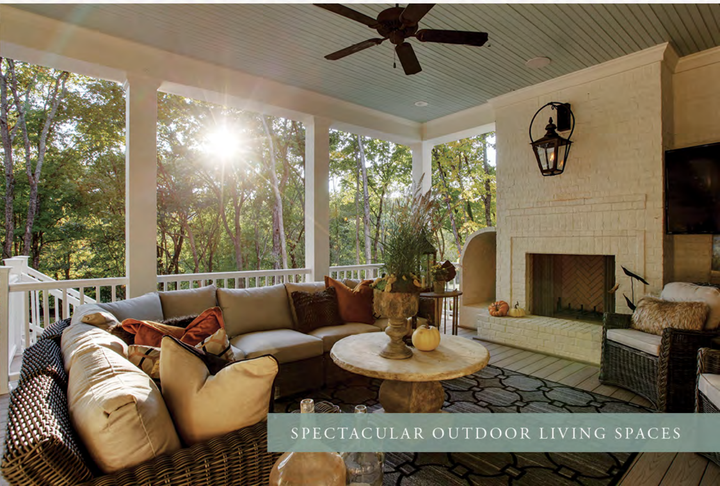
SPECTACULAR OUTDOOR LIVING SPACES