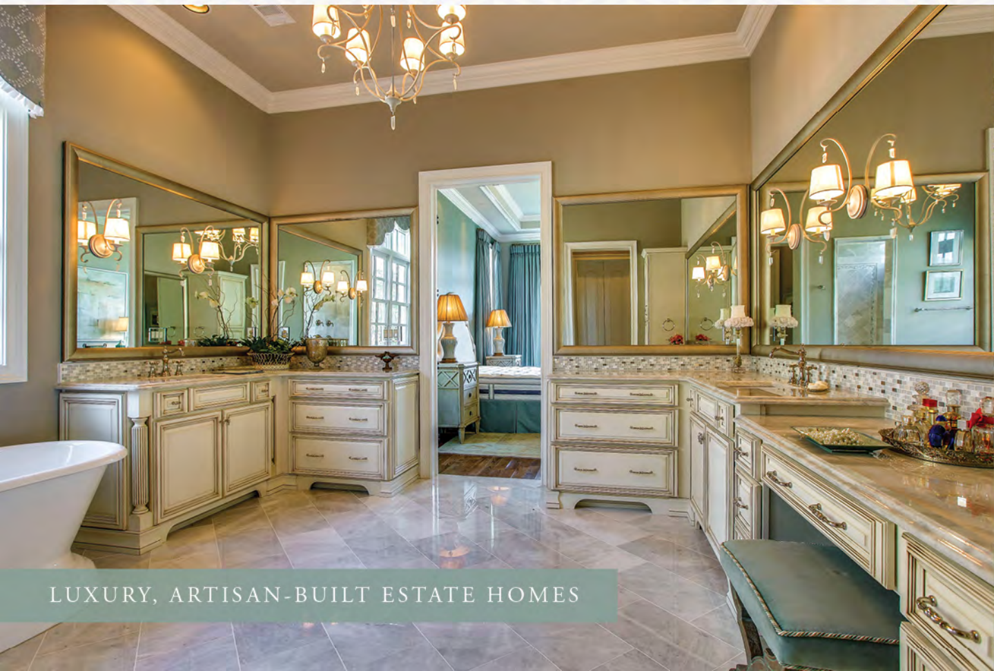
LUXURY, ARTISAN-BUILT ESTATE HOMES