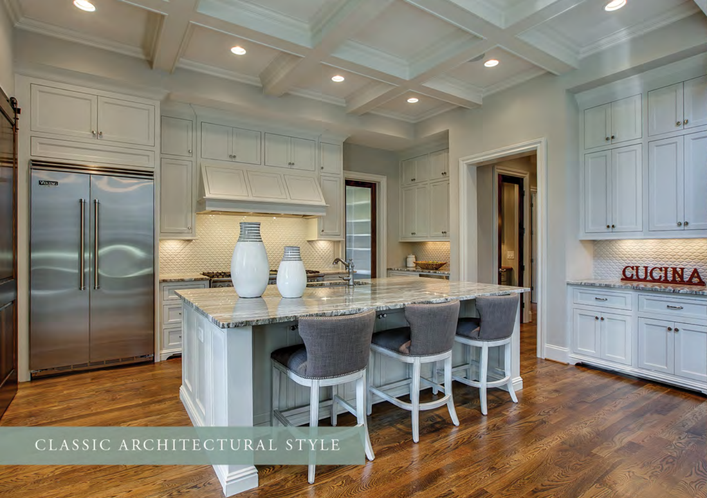
CLASSIC ARCHITECTURAL STYLE