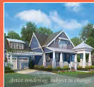
Artist rendering, subject to change.

Magnolia Park is a unique collection of homes that will be nestled in an idyllic park-like setting, when taken as a whole, will create a tranquil and harmonious streetscape. Each home will be accentuated with interesting layers of materials such as; custom iron work, joinery by master craftsmen, varied paint palettes, large windows, and expansive porches. The result will be a collection of homes with their own unique artistry and a neighborhood of endearing individuality.