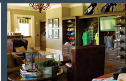
GOLF PRO SHOP