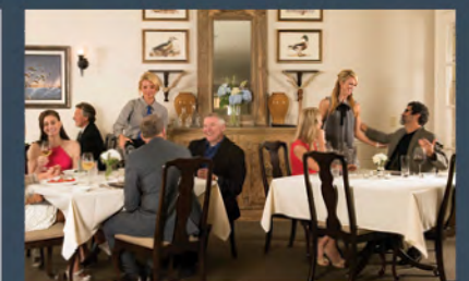
CASUAL & FINE DINING