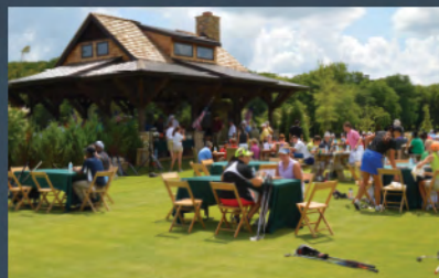
TOURNAMENTS & EVENTS