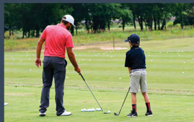
KIDS' GOLF CLINICS